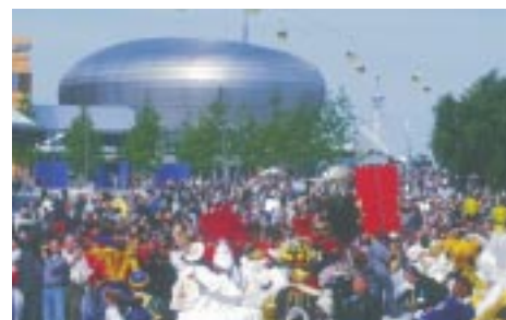
Jovial atmosphere on the Expo 2000 plaza

T-Mobil was not only active behind the curtains, but also supported the T-Digit project of its parent company, Deutsche Telekom. This giant, cube shaped exhibition object had been developing into a visitor attraction. Designed as a construction with four hyper-dimensional screens the Digit presented Expo information and transferred message from all over the world; for example, the Football EM in Belgium and The Netherlands, the Tour de France and the Olympic Games in Australia. As a