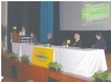
Scenes from the first FITCE national conference in the Czech Republic